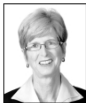
CHRISTINE TODD WHITMAN