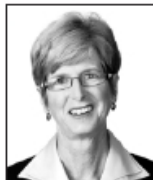
CHRISTINE TODD WHITMAN Age 65 Director since 2003 Chair, Governance and Stockholder Relations Committee