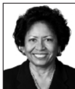
RUTH J. SIMMONS Age 66 Director since 1999 Member, Compensation Committee