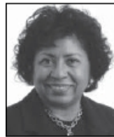
RUTH J. SIMMONS Age 64 Director since 1999 Chair, Governance and Stockholder Relations Committee