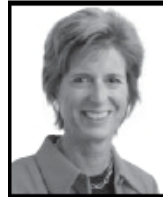
CHRISTINE TODD WHITMAN Age 63 Director since 2003 Member, Governance and Stockholder Relations Committee