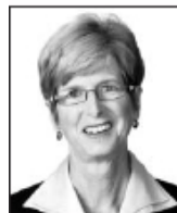
CHRISTINE TODD WHITMAN Age 64 Director since 2003 Member, Governance and Stockholder Relations Committee