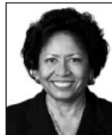
RUTH J. SIMMONS Age 65 Director since 1999 Chair, Governance and Stockholder Relations Committee