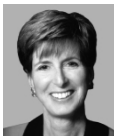
CHRISTINE TODD WHITMAN Director

Chief operating officer of the company since 2000. Joined the company in 1980; elected president of the company's Semiconductor Group and executive vice president in 1996. Director, Semiconductor Industry Association.